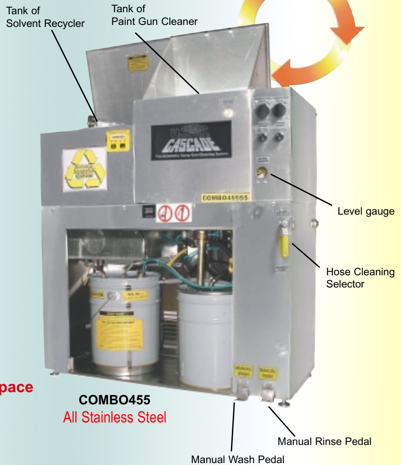
COMBO455 All Stainless Steel

Ideal for the busy shop with limited space