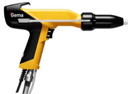
OptiSelect Pro with SuperCorona