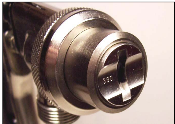
390SS ( 46-2390 )