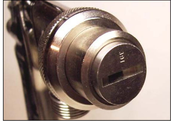
391SS ( 46-2391 )