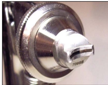
709SS ( 46-2020 )