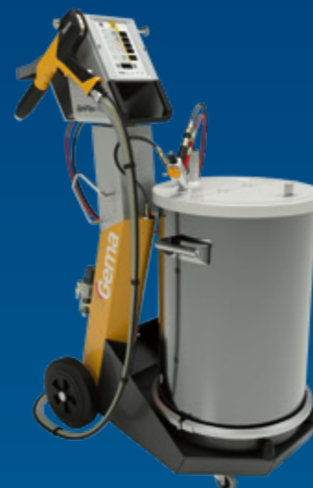
OptiFlex® Pro F