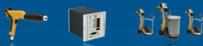
OptiSelect® Pro Type GM04 OptiStar® Type CG21 OptiFlex® Pro Manual coating equipment