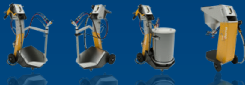
OptiFlex® Pro B OptiFlex® Pro Q OptiFlex® Pro F OptiFlex® Pro S