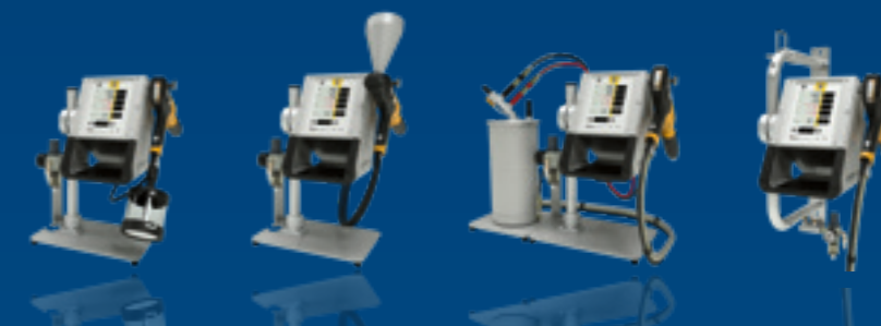
OptiFlex® Pro C OptiFlex® Pro CF OptiFlex® Pro L OptiFlex® Pro W