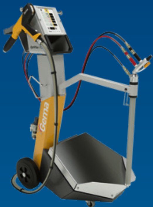
OptiFlex® Pro B