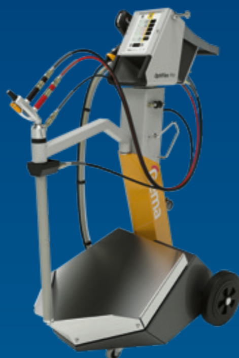
OptiFlex® Pro Q