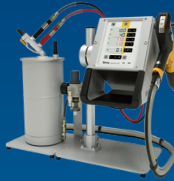
OptiFlex® Pro L