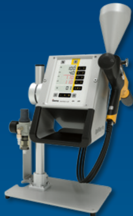
OptiFlex® Pro CF