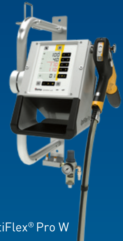
OptiFlex® Pro W