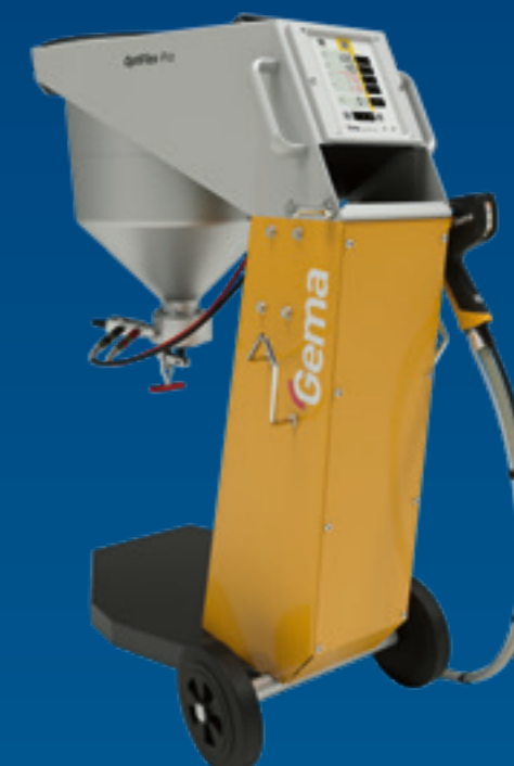
OptiFlex® Pro S