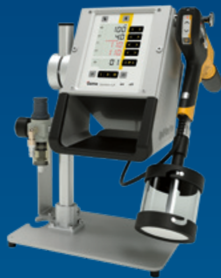
OptiFlex® Pro C