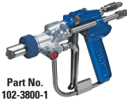
Part No. 102-3800-1

Binks Century LEL External Mix Chopper gun