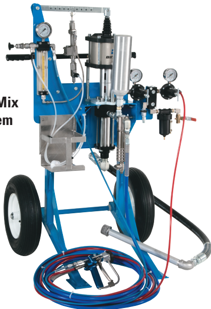
17:1 External Mix Gel Coat System

Get a responsive fluid section with ball checks optimized for medium to heavy viscosity materials