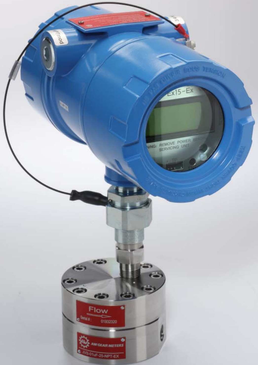
Precision Liquid Flow Measurement