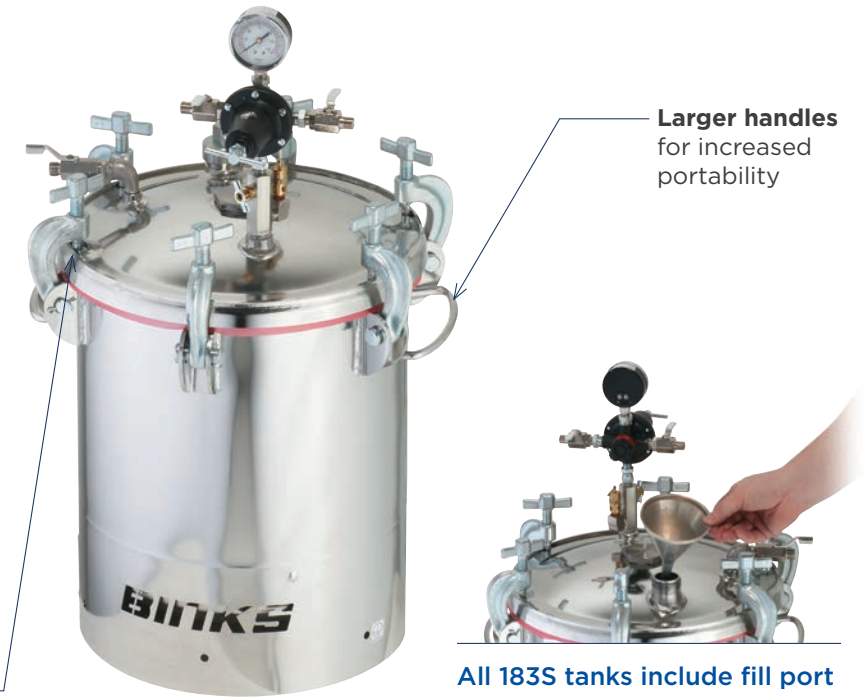
All 183S tanks include fill port