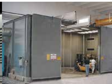
< Optional crane opening