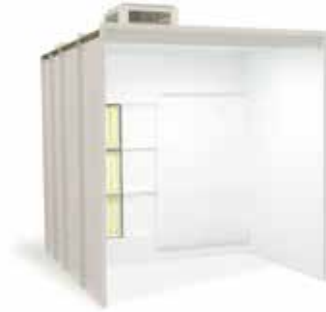
Optional white pre-coated panels