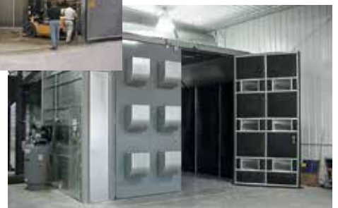
Optional > rubber lining