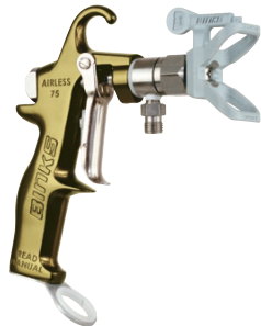
Airless 75 Direct Connect