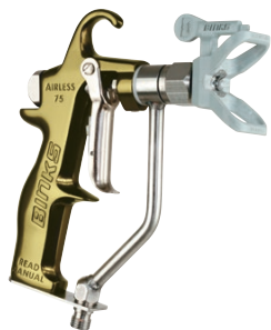
Airless 75 with External Stainless Steel Tube