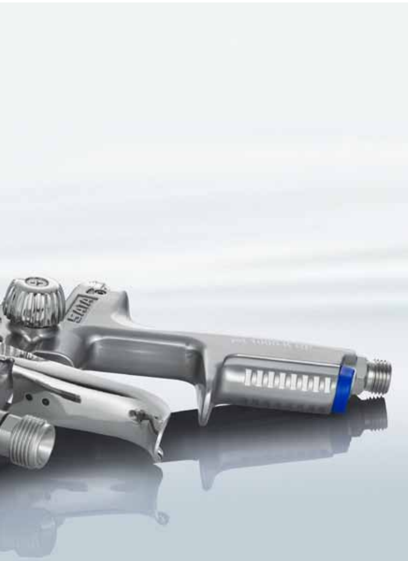
Complementary accessories are available for special applications, such as radiator coating.